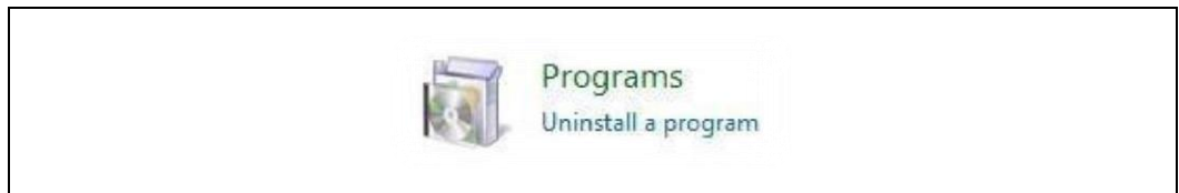
Figure 2. Uninstall a program